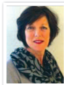
Dr Ide Delargy

Recovery rates for doctors treated for addiction in such programs are high: - 82% abstinence for alcohol addiction (compared to 10% in the general population) and - 88% abstinence for drug use (compared to a 10-20% in the general population).