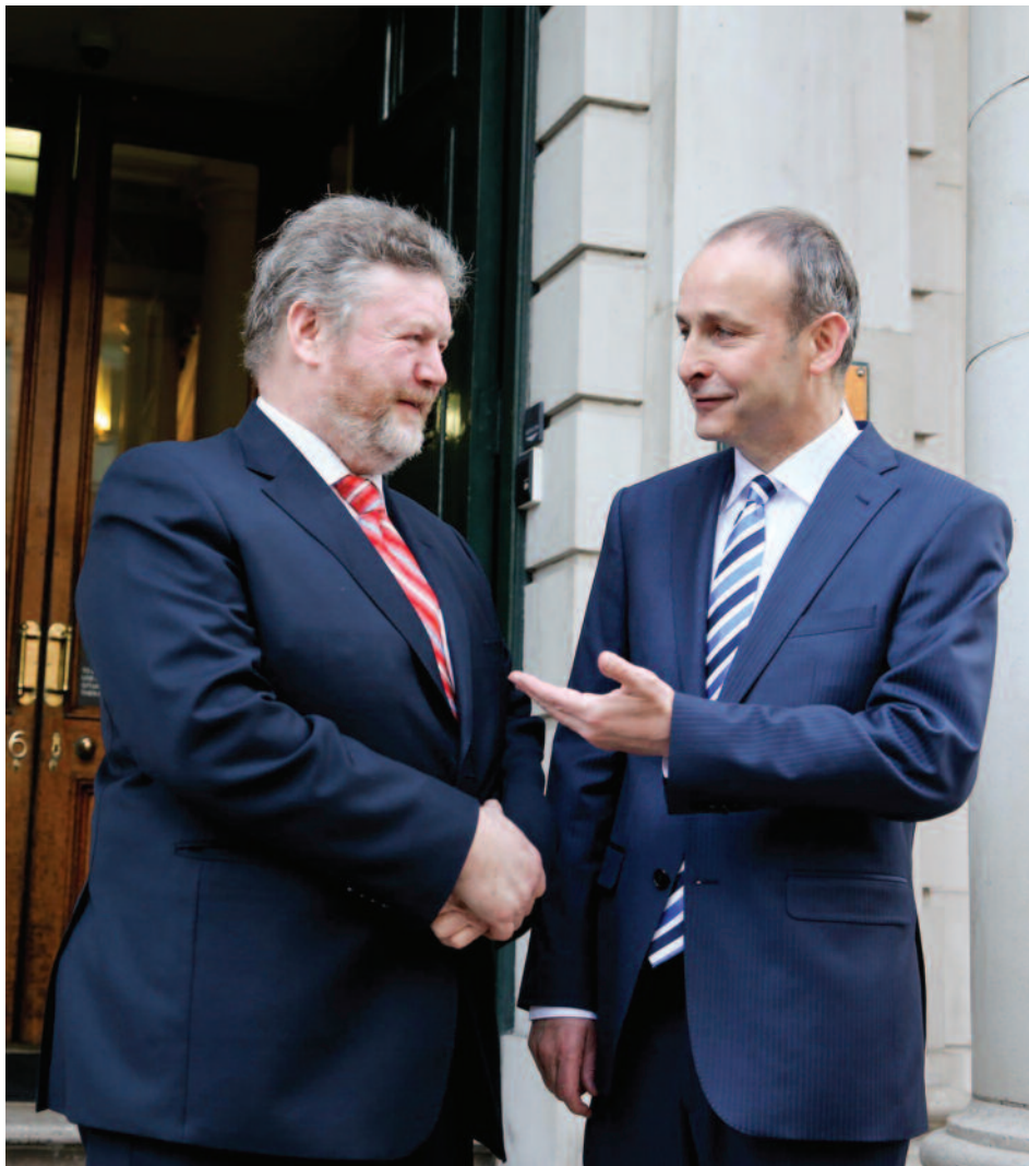
Minister for Health Dr James Reilly and Fianna Fail Leader Micheal Martin, pictured at the recent event in the RCPI marking Ireland's 10 year anniversary of the smoking ban in the workplace.

The RCPI policy group comprises representatives from a range of medical specialties, from within RCPI's own Faculties and Institute, and from other external bodies such as the Irish College of General Practitioners, the Irish Thoracic Society and the Psychological Society of Ireland. The ICO has reached out to the relevant personnel with the RCPI to offer our support for the policy group.