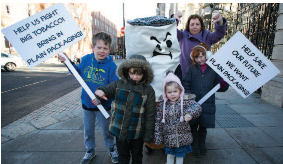
Senator and member of the Joint Oireachtas Committee on Health, Jillian Van Turnhout, lends her support to the introduction of Standardised Plain Packaging for Tobacco in Ireland with a group of young children outside Leinster House.

With the current and predicated changes in smoking prevalence in Ireland and if current policies are maintained and strengthened children born in Ireland today, will live in a tobacco free Ireland when they turn 18. Tobacco control is a health issue that has widespread cross party support and the impact of smoking on eye health must be highlighted at every opportunity.